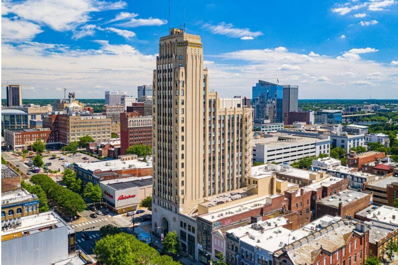
Deco at CNB Richmond, Virginia

The redevelopment of the Central National Bank building was part of a larger transformation that was going on along Richmond's Broad Street corridor. Private and public sector investment in the city began to attract new residents and bring new life to downtown.