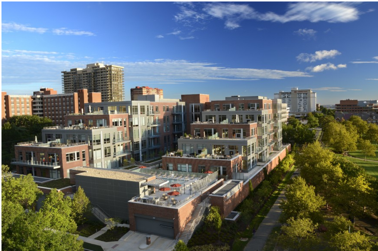
Oronoco Waterfront Residences Alexandria, Virginia