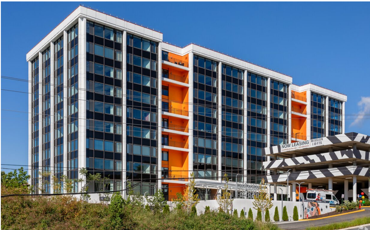
Mission Lofts Falls Church, Virginia (Fairfax County)

Highland Squares Holdings LLC purchased the property in 2017 for "the cost of the parking alone," according to the developer. The property is located in an Opportunity Zone along an important east-west corridor in Northern Virginia, which created an opportunity to access additional federal funding sources for the redevelopment of the building.