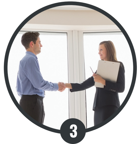
3 KNOW YOUR PROSPECT