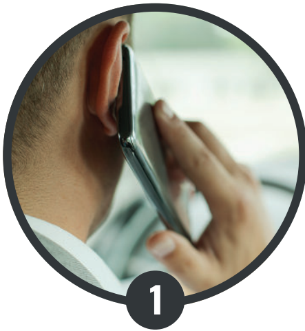
1 RECEIVE A CALL

Combat Fraud, Mitigate Risk, and Stay Safe with FOREWARN – Your FREE Member Benefit!